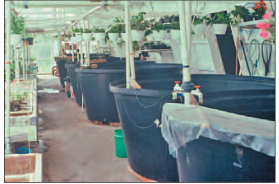
Aquaponic greenhouse at S&S Aqua Farms, West Plains, Missouri.