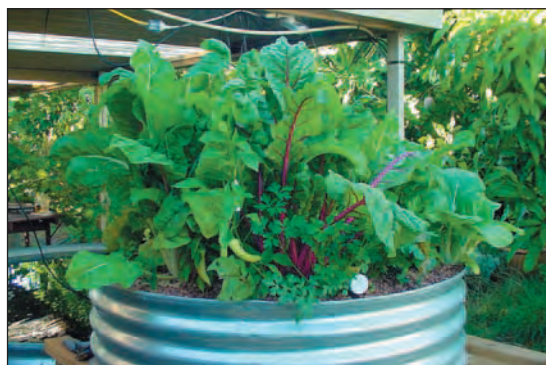
Aquaponic vegetable bed in Australia.

Aquaponics is a bio-integrated system that links recirculating aquaculture with hydroponic vegetable, flower, and/or herb production. Recent advances by researchers and growers alike have turned aquaponics into a working model of sustainable food production. This publication provides an introduction to aquaponics with brief profiles of working units around the country. An extensive list of resources point the reader to print and Web-based educational materials for further technical assistance.